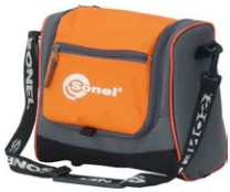
M6 carrying case