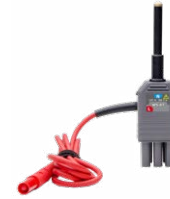
WS-07 adapter for measuring Z(L-N) loop