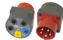
Three-phase socket adapter 16 A / 32 A