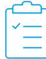
Factory calibration certificate