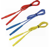
Test lead 1.2 m (banana plugs) red / blue / yellow