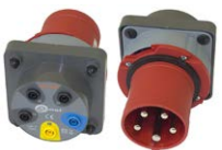
Three-phase socket adapter 63 A