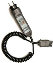
WS-03 adapter with START button (UNI-Schuko plug)