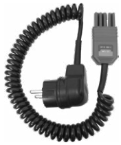
WS-05 adapter (UNI-SCHUKO angular plug)