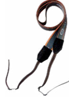
M1 hanging straps