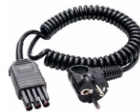
WS-04 adapter (UNI-SCHUKO angular plug)