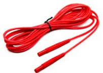
Test lead for fault loop measurement (banana plugs) 5 m / 10 m / 20 m