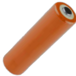
4x LR6 1.5 V battery