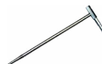
2x earth contact test probe (rod), 30 cm