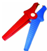
2 x Kelvin clamp 1 kV 25 A WAKROKELK06