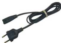
Mains power cable Euro 2-pin plug / IEC C7 plug WAPRZLAD230