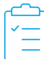
Calibration certificate with accreditation