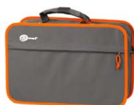
L1 carrying case WAFUTL1