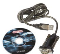
USB/RS-232 adapter WAADAUSBRS232