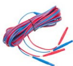
Double-wire test lead (10 A / 25 A) U1/I1 6 m / 10 m / 15 m WAPRZ006DZBBU111 WAPRZ010DZBBU111 WAPRZ015DZBBU111