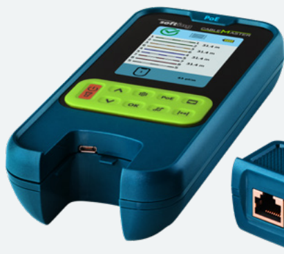
Removable RJ45 remote port